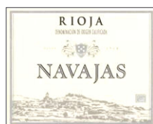
Bodegas NAVAJAS Tinto 2009 RIOJA 13.5%

This oak-aged Rioja shows the determination of Navajas to over-deliver. Though labelled Tinto, it is actually a semi-crianza but tastes more like a good Crianza! A blend of 95% Tempranillo with Mazuelo providing the balance it has been aged nearly 4 months in oak barrels to add a distinctive vanilla character to the bright red fruit flavours. A further difference from 'standard' Rioja is that Roberto has bottled the wine with minimal filtration to preserve the vibrancy of the fruit.