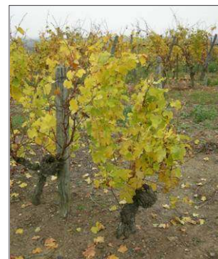
The remarkable Verdelho vines.